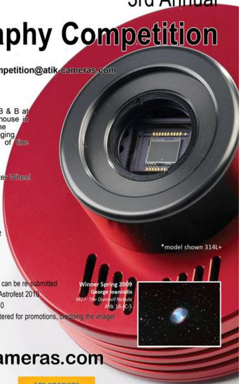
*model shown 314L+

*For full terms & conditions please see our website