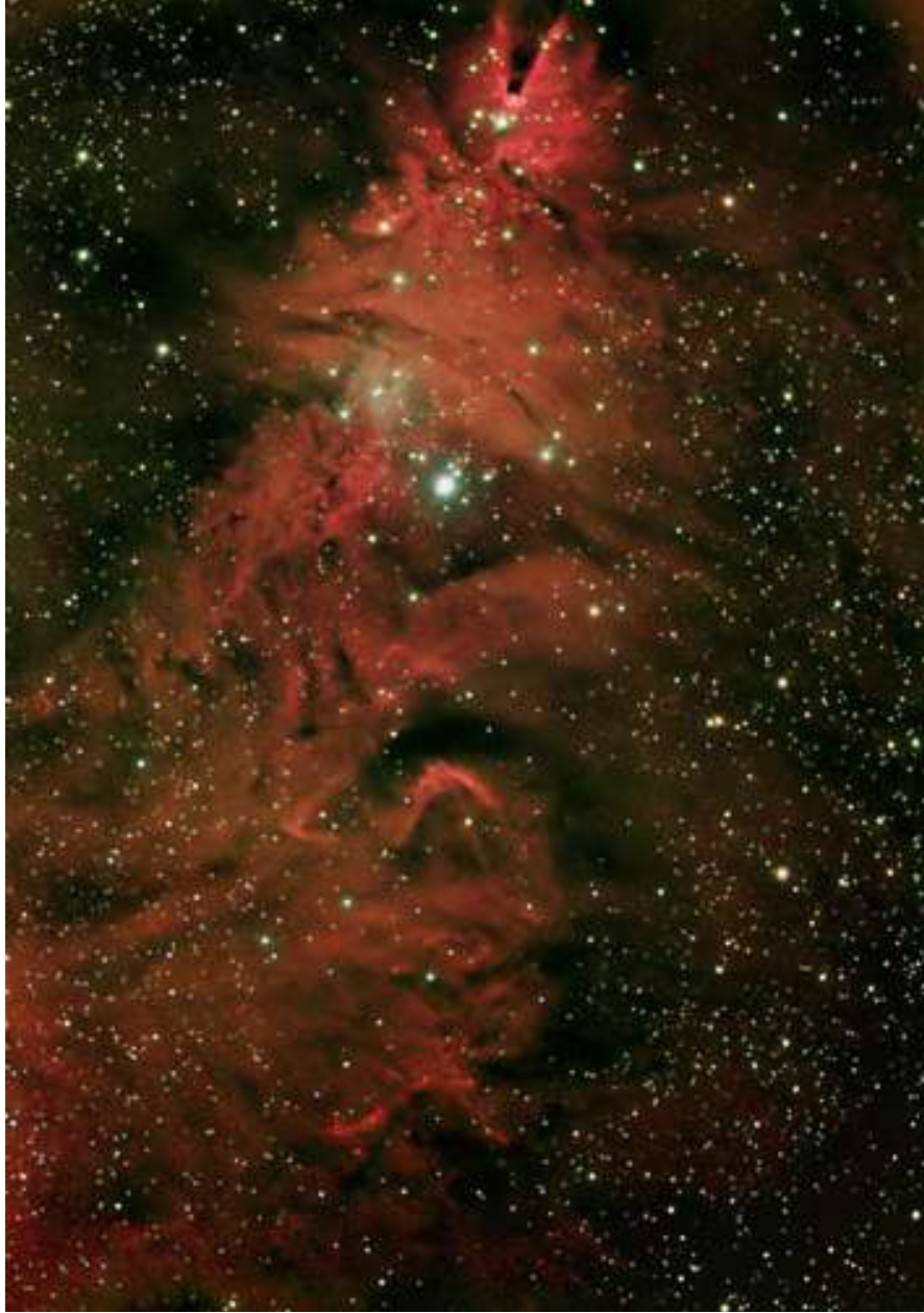
Christmas Tree Nebula by Vincent Bygrave