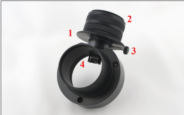
1 - Focusing ring; 2 - T-thread extensions; 3 - Locking screw; 4 - Pickup prism

The OAG was designed to be attached directly to the EFW2, but with the correct adapters it may be possible to attach it to T-threaded accessories. The OAG system is as follows: