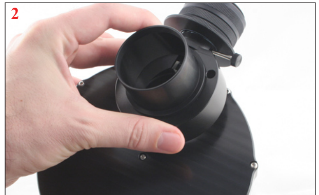
2- Align the OAG with the 3 holes and attach it to the EFW2, using the 3 supplied screws.