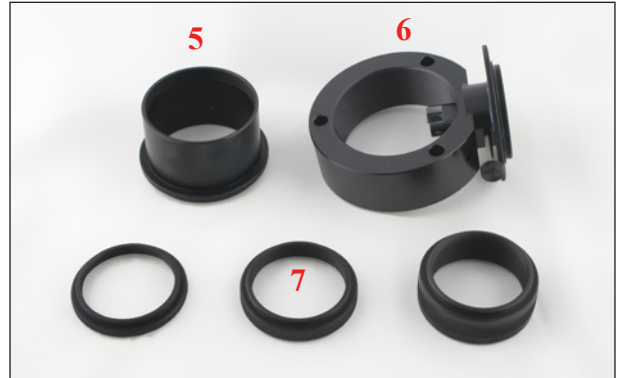
5 - 2" to M54 adapter; 6 - Main body; 7 - 4mm, 7mm and 15mm T-thread extensions