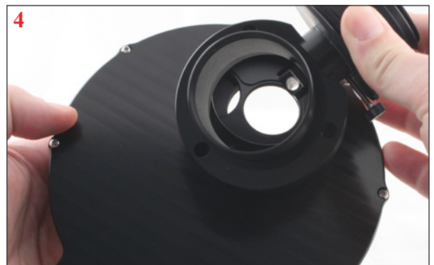
4- If you need to take it off, just undo the screws. Note that to change filters there's no need to take the OAG off.