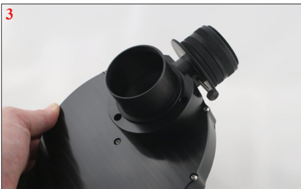
3- Verify that the 3 screws are in place. The OAG should now be securely attached to the EFW2.